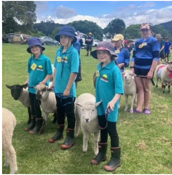
Lots of them won ribbons with their lamb / calf.